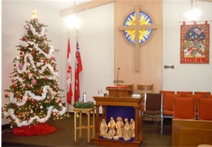
The Season of Advent