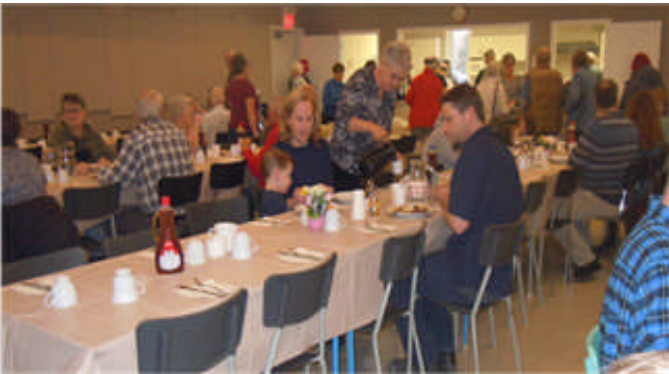
The crowd was steady and no one left hungry!