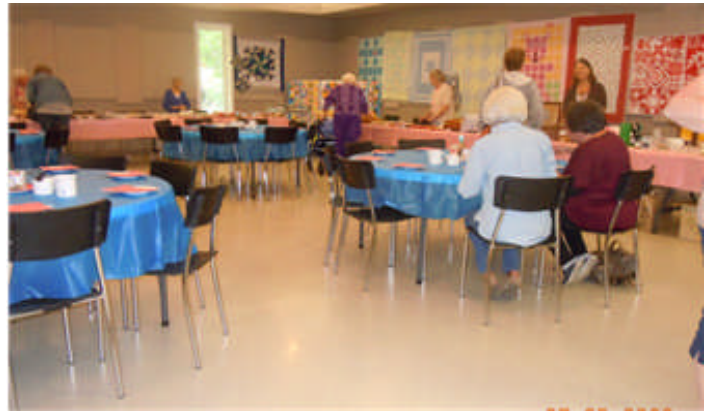
The new round tables and the new rectangular tables made setting up and serving a pleasure with lots of room for visiting with neighbours and friends.

THANK YOU to everyone who decorated, donated items for selling, who helped with setting up, baked, served, cleared, washed, cleaned up and put away!